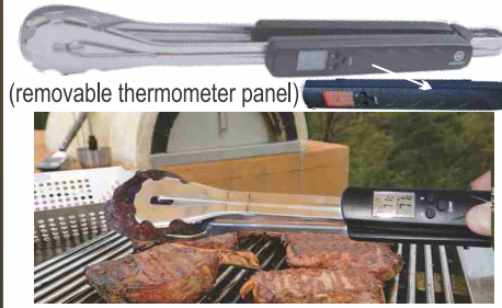
(removable thermometer panel)